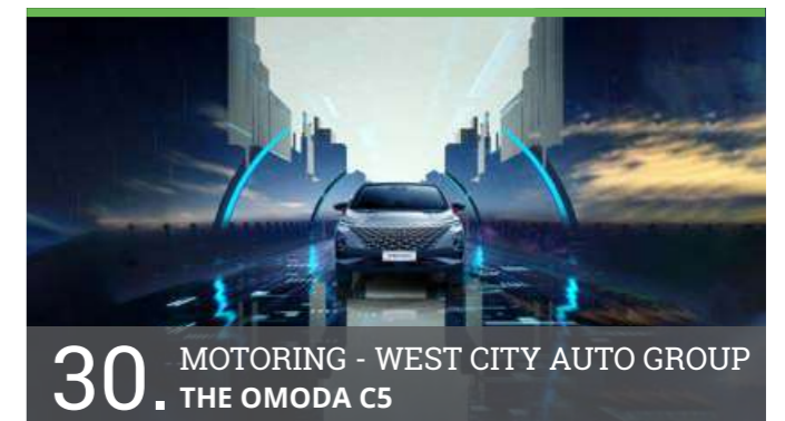
30. MOTORING - WEST CITY AUTO GROUP THE OMODA C5