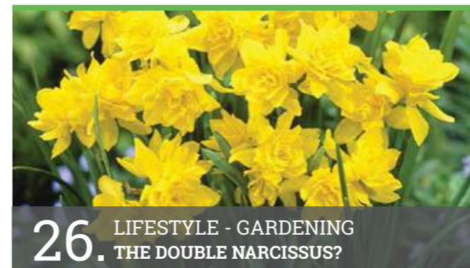
26. LIFESTYLE - GARDENING THE DOUBLE NARCISSUS?