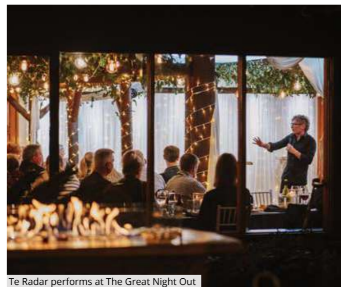
Te Radar performs at The Great Night Out

BUSINESS SOLUTIONS YOUR BUSINESS SUPPORT FOR A THRIVING COMMUNITY