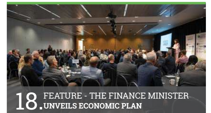
18. FEATURE - THE FINANCE MINISTER UNVEILS ECONOMIC PLAN